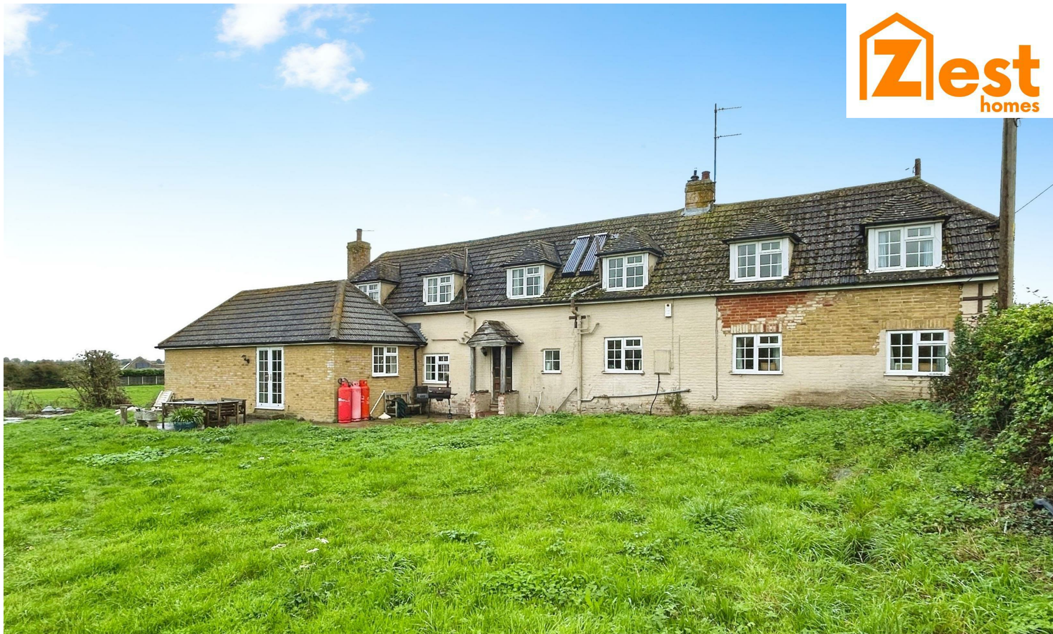
Animal Farm Mill Road, Canterbury, CT3 1LB £950,000